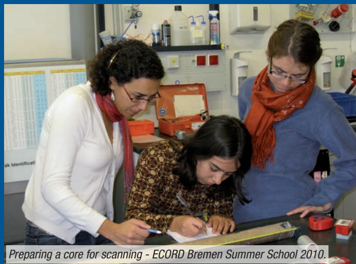
Preparing a core for scanning - ECORD Bremen Summer School 2010.

The Bremen Core Repository organises Summer School courses, which offer unique opportunities to introduce PhD students and young Post-docs to IODP science and operations at an early stage of their career. The Summer School provides a range of teaching, from a general introduction to compiling IODP proposals, to learning about the ongoing research within this thrilling international