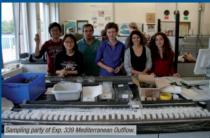
Sampling party of Exp. 339 Mediterranean Outflow.

The BCR was established in 1994 and now stores almost 154 km of cores acquired during 88 expeditions. Approximately 200 scientists visit the repository annually, sometimes working on the cores in week-long sampling meetings. As many as 70,000 samples per year are taken by visiting scientists and the repository staff. In its 21 years of operation, around 902,521 samples representing about 3,901 individual requests have been taken and distributed worldwide.