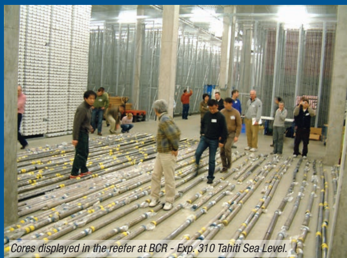
Cores displayed in the reefer at BCR - Exp. 310 Tahiti Sea Level.

In its role within the ECORD Science Operator (ESO) Consortium, the MARUM, University of Bremen is tasked with curating and archiving collected cores, as well as providing offshore (mobile laboratory containers) and onshore laboratory facilities for systematic core sampling and data gathering according to IODP measurement procedures.