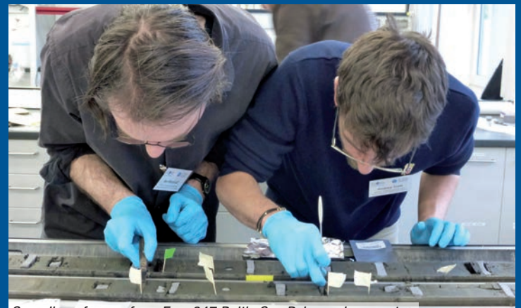
Sampling of cores from Exp. 347 Baltic Sea Paleoenvironment.

Cores from present and past scientific ocean drilling programmes are stored in three repositories: