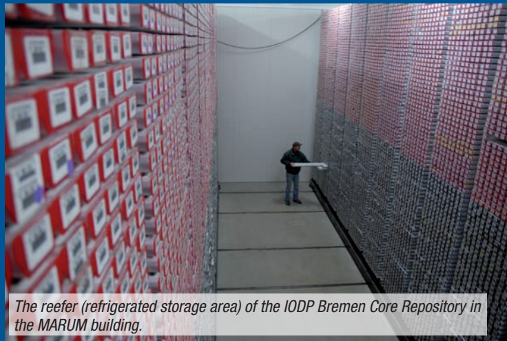
The reefer (refrigerated storage area) of the IODP Bremen Core Repository in the MARUM building.

The IODP Bremen Core Repository (BCR) at the MARUM, Center for Marine Environmental Sciences at the University of Bremen, is one of three core repository facilities worldwide. The BCR has state-of-the-art laboratory and office facilities and a large refrigerated storage area with a movable rack system. The repository provides services to the international community through advanced curation and sampling techniques, database archiving (Drilling Information System, DIS), and participates in a wide range of education and outreach activities.