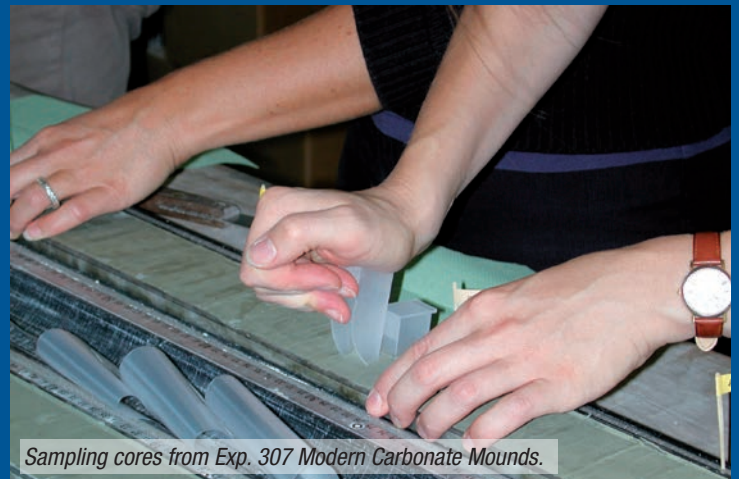
Sampling cores from Exp. 307 Modern Carbonate Mounds.

With almost 4,200 visitors from all over the world so far, the repository is an important hub for IODP/ECORD, and the wider scientific community. The BCR significantly contributes to the exchange and transfer of marine science knowledge, leading to invaluable international co-operation and scientific interaction.