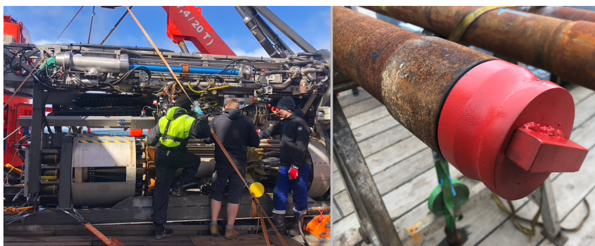
Figure 2 Left: The MeBo70 is serviced on deck between two deployments and loaded with new drill rods. Right: Simple borehole plug that has an autonomous temperature measurement system mounted inside. This drill rod is the last to be set before the MeBo takes off; the instrumented plug will be recovered in two years by ROV.

Both the Osmo-sampler and the borehole plugs for temperature monitoring can be unscrewed (Fig. 2) and can be recovered with the remotely operated vehicle (ROV) on later expeditions and exchanged for other observatories.