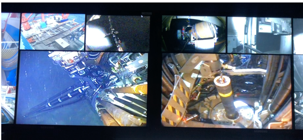
Figure 1 View of some of the control screens inside the MeBo control container. Here the pilots prepare the take-off maneuver back to the MERIAN. A borehole observatory can be seen on the bottom right with a white cover and yellow marking.

In total, we managed to drill three boreholes through overburden sediments into the oceanic crustal basalts in the past week. Two of the drill holes were drilled in pairs on a relatively young portion of the ocean ridge flank approximately 80 meters apart. The chemistry of the crustal fluids and the temperature changes deep in the borehole are to be recorded over a period of two years.