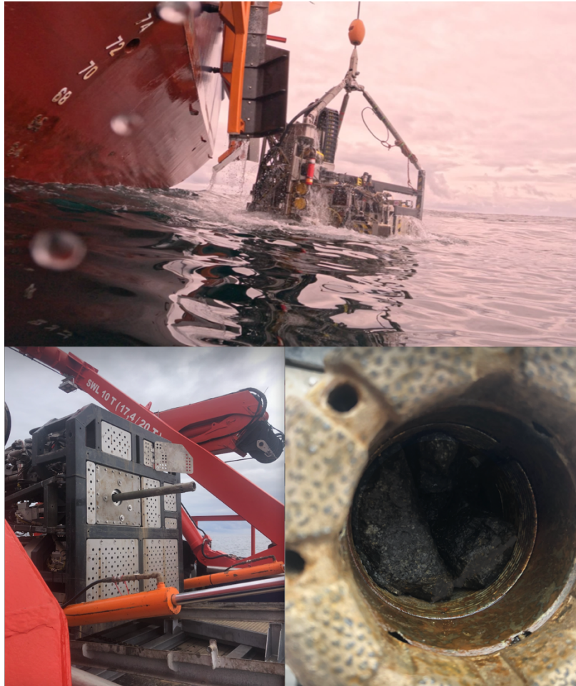
Abbildung 2 Above: MeBo recovery via the A-frame of the MERIAN. Bottom: The rig's terminal drill rod could not be stowed in the rig (left) because basalts blocked the core barrel (right).

Over the weekend, the MARUM MeBo70 drilling rig was used for the first time on the seabed for a pilot drilling in the Squid Pond. After a good 24m of sediment cover, we encountered ocean crust material and had to drill carefully with slow drilling progress. Some pieces of basalt blocked the core barrel at the end of the drilling, as we were able to determine on deck after successfully recovering the drill (Fig. 2).