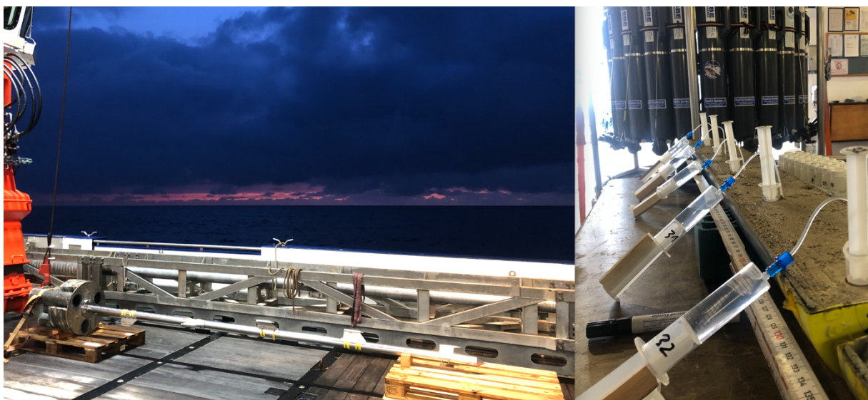
Figure 1 Left: The temperature gradient probe after recovery on deck. Right: The working half of the gravity cores is sampled with rhizons for geochemical analyses.

In the week from 10.-16.07. we reached the working area at the southern tip of the Reykjanes Ridge in the middle of the Atlantic on Wednesday morning. The station work initially served to explore a small sediment trough on the eastern flank of the ridge. In the so-called Squid Pond we recorded a velocity sound profile and recorded hydroacoustic data before using gravity corers and in situ temperature lances (Fig. 1) to collect material and data where our understanding was still incomplete after the preliminary investigations on the METEOR M183 cruise in 2022. Both methods have been used primarily on the eastern side of the sediment trough, where cold seawater is charged into the seafloor and continues to circulate westward through the crust, being heated and expelled as hydrothermal fluid again. Changes in oxygen and alkalinity confirm this fluid movement.