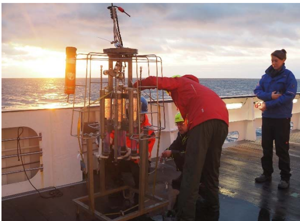
Figure 1: Sediment sampling with the Multicorer in calm seas and a beautiful sunrise.

At the beginning of the week we had three days of stormy seas. Due to the weather, we were limited to water sampling with the water rosette and hydroacoustic surveys. On Monday morning the sea was still calm enough to record a known flare location in high resolution with an echo sounder that we brought along and installed in the moon pool, which will allow us to estimate fluxes of escaping methane. In a flare area near a salt dome discovered on Heincke cruise HE537, we were able to conduct systematic CTD sampling, using ADCP profiles to look for flow directions. First results of CTD measurements directly above a flare show a 5-fold increase in methane concentrations compared to the surrounding area. Using hydroacoustic surveys conducted at night, we were able to detect more flares and even two wrecks lying on the seabed, which are, however, marked on the nautical charts. We were also able to observe three flare locations over an entire tidal cycle, which allowed us to gain very valuable insights into their activity and intensity. This was only possible because the ship could be kept in position with an accuracy of less than 10 metres, despite the sometimes very stormy sea with waves up to 5 m high and a wind force of up to Beaufort 9.