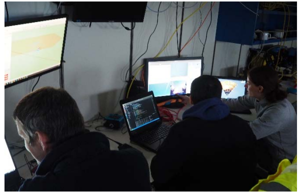
Figure 4: Operations of the BlueROV are tracked and documented live.