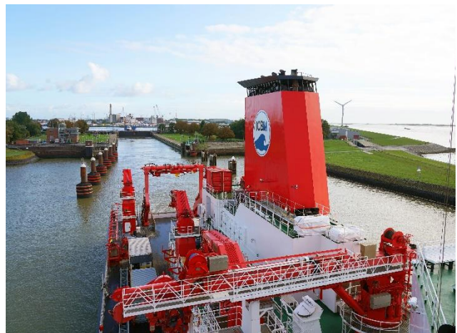
Figure 2: On 12 October, 2020, R/V SONNE left the lock chamber to the Emden outer harbor at 11:10 a.m. with destination of the Mediterranean Sea.

After a first night on the research ship in the port of Emden, it was time to cast off on Monday, 12 October at 10:00 a.m., and the SONNE moved away from the pier. On the starboard side of the ship, the lifeboat, which had been repainted in the shipyard, was hauled in. Subsequently, the ship moved towards the lock with the help of a tug boat and under the supervision of the port pilot. Everyone on deck watched the lock maneuver in fresh sea air and a view of the Ems and the Dollart (Fig. 1). After the SONNE had left the lock chamber (Fig. 2), it followed the Ems estuary past the island of Borkum into the North Sea, where there were significantly more ship movements. Wind force 7 on the Beaufort scale with occasional gusts of 8 in the North Sea were already a first challenge for some of us, which put us in the mood for the coming weeks of seafaring. As we continued towards the English Channel, the sea calmed down more and more, so that we had a fairly calm journey, albeit in cloudy weather, and therefore could only see the famous chalk cliffs of Dover very blurred. On Tuesday, 13 October, the mandatory safety maneuver was carried out and that afternoon we started our