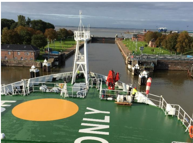
Figure 1: View from the observation deck of R/V SONNE at the entrance to the large sea lock that connects the Emden inland port with the Ems (© Yiting Tseng).

On Monday, 12 October 2020, R/V SONNE left its berth at the Südkai, Poller 16-20 in the Emden inland port, at 10:00 a.m. local time, to set out for the eastern Mediterranean, where marine geological studies are planned in Greece and Italy. The departure was preceded by 4 days of quarantine for all ship crew members and scientific participants, which were spent in single rooms in hotels in Leer without physical contact. Nevertheless, we stayed in contact via the internet and telephone and held a first video conference among the scientists. All participants were tested for the corona virus and after all tests were negative, the expedition was able to start. The crew and a vanguard of 3 scientists embarked on Saturday, 10 October on the SONNE, and the main group of scientists followed the day after. Our 6 containers with the scientific equipment had already been delivered from Bremen on Friday, 9 October, and had been loaded onto the ship at a place we had previously selected. After the arrival of the scientists on Sunday morning, 11 October, on SONNE, the containers were opened and most of the scientific equipment was distributed in the laboratories and on the working deck and tied down for the sea. After 4 days in the hotel almost all of us welcomed this physical work. The departure of R/V METEOR, which was on the north quay on the opposite side of the harbor basin, was observed in the afternoon at 2:30 p.m., while our colleagues waved vigorously.