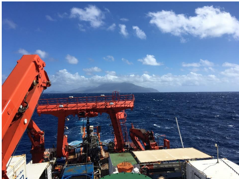
Fig. 1: View over the working deck of RV METEOR towards our target area southeast of Montserrat.

The previous day, an additional 11 scientists had arrived, giving a total of 23 scientists who met at the METEOR, with participants from MARUM, University Bremen, the GEOMAR, the University of Birmingham and the Southern Methodist University Dallas. By lunchtime on Monday the 29 th April, all labs were set up, boxes were stowed away, and we left the Port of Pointe-à-Pitre, Guadeloupe.