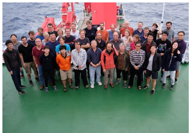
Figure 4: Group picture on the bridge deck. It's done; On Friday, November 16 at 08:00 the last station work of SO266 was completed with a CTD. The last two expedition days were used for seafloor mapping.

Today, 18 November, we reached the port of Kaohsiung and immediately began to clear the expedition equipment and the containers. While our Taiwanese scientists are already at home, most of us will return home by plane tomorrow.