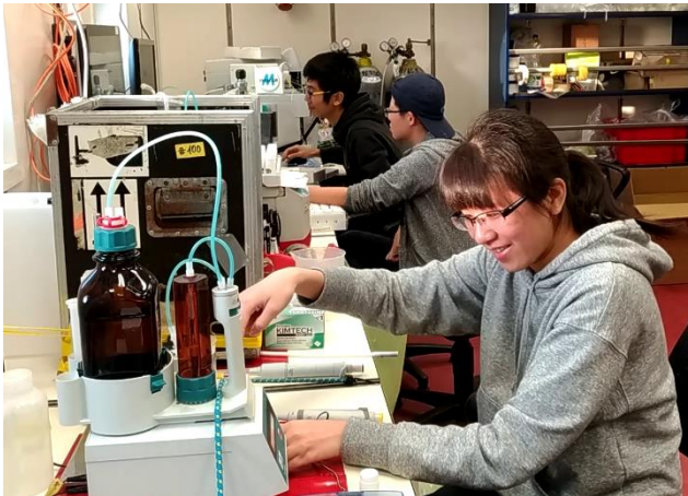
Figure 1: View of the dry laboratory 1 of FS SONNE, where the chloride, sulfate, ammonium and hydrogen sulfide contents of the pore water are analyzed after each drilling.