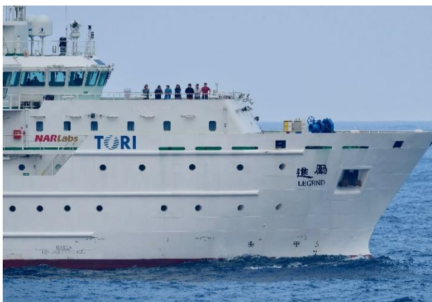
Figure 3: On Thursday morning the Taiwanese research vessel LEGEND visited us. The ship was built in Vietnam, was recently acquired by the Taiwan Ocean Research Institute TORI and is still in the testing phase.