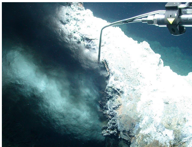
Figure 1: The temperature measurement in the outflow opening of the black smoker showed that the fluids are more than 300°C hot. In addition to this active smoker, we found and sampled numerous inactive and extinct smokers (MARUM ROV dive 463).