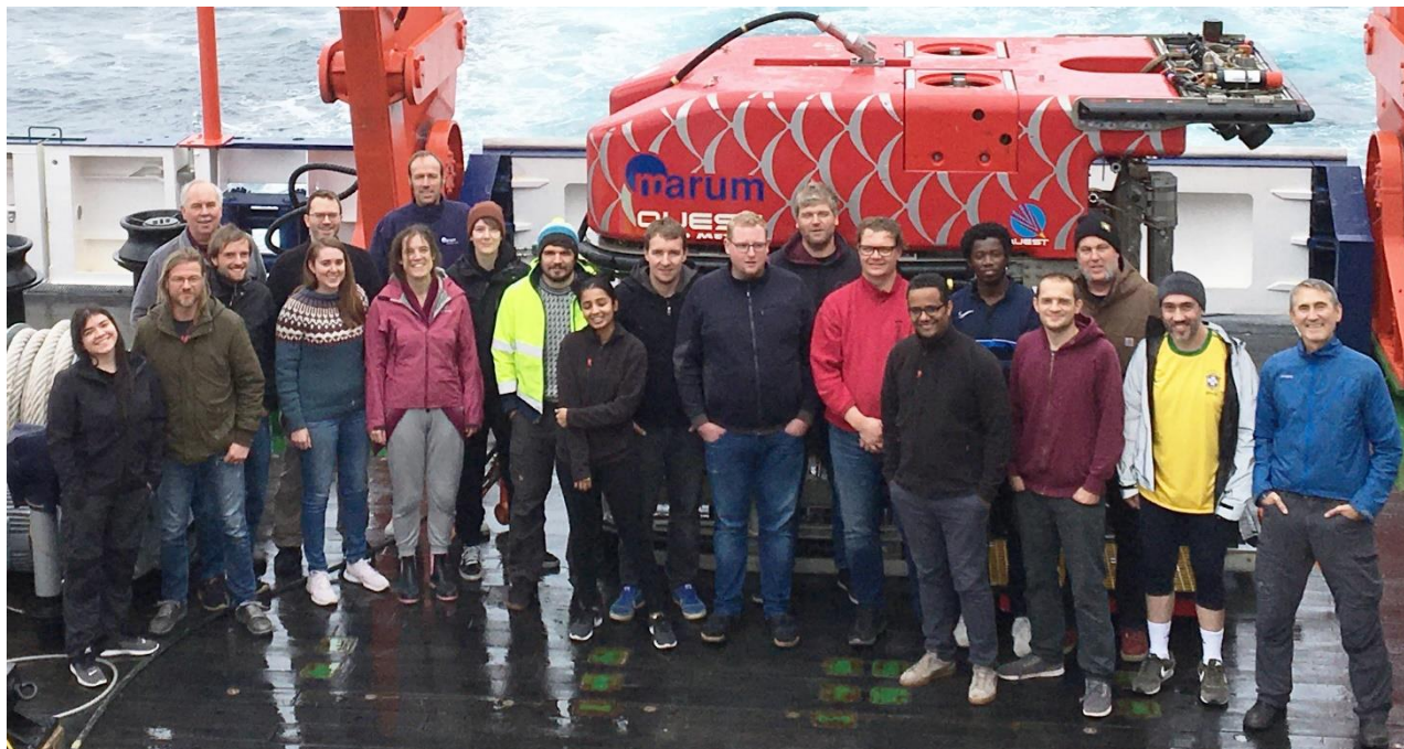
Figure 3: After 28 days on an expedition in the Norwegian Greenland Sea with great scientific success, the scientific participants of the MSM109 are looking forward to returning home.

marginal fault at a water depth of 3,000 m. We call it the Jøtul hydrothermal field, a name for a being that in Norse mythology corresponds to a giant that dwells in a mountain or range. The last two ROV dives, on Thursday and Friday, we dived 50 km to the south in what is probably the youngest volcanic area in 3,200 m water depth. There, too, we had already found hydrothermal relics on an earlier dive, but they were very difficult to find in a 10 m deep and very narrow canyon of mainly piled up pillow lavas. In fact, more hydrothermal relicts were found on Thursday with possible sulphide deposits. Friday's short ROV dive captured an abundance of existing lava structures and morphologies. We were also able to welcome viewers from Germany to this dive at short notice via telepresence, who followed the internet link of the MARUM YouTube channel.