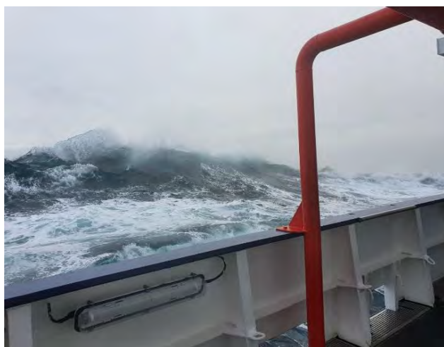
Figure 2: After a 6-hour drive through the northern Norwegian fjords, the open sea welcomed us with rather unpleasant weather.

After two nights on the research vessel in the port of Breivika/Tromsø, on Wednesday, 6 July, it was time to cast off and the MARIA S. MERIAN started to move. A 6-hour journey took us first through the 4-5 km wide passage of Grøtsundet and then about 25 km through the fjord landscape of Fugløyundet before we reached the open shelf sea of the Barents Sea. The rain in Tromsø and the dense clouds within the fjords made us expect bad weather, which we were then exposed when we reached the open sea. Wind speeds of 8 on the Beaufort scale with occasional gusts of up to 9 whipped up the sea (Fig. 2) and caused some of us to feel unwell, which lasted until mid-morning the following day. Towards evening the sea had calmed down and everyone was fine again. On the way to our working area, we overran the Håkon Mosby mud volcano (Fig. 3) on the continental slope to the Barents Sea fan. This mud volcano has been well studied in the past and