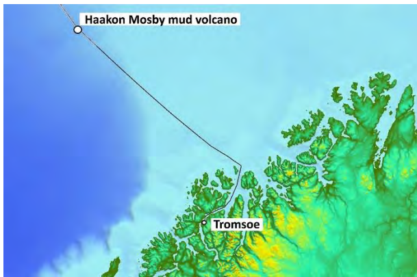
Figure 3: After leaving the port, our course took us through the fjords of northern Norway, over the shelf of the Barent Sea and the Barent Sea fan to the deep sea. On the continental slope we drove over the Håkon Mosby mud volcano.

appears to be characterized by continuous activity of methane leaks. This time, we were able to detect the active escape of gas in the water column above the mud volcano with the ship's hydro-acoustic systems when crossing it (Fig. 4). We reached our actual target, the Knipovich ridge, on Friday 8 July, starting to the south with a CTD station in an area where signals from a hydrothermal plume could be identified in the water column in previous years. A planned AUV dive to measure the seabed had to be aborted for technical reasons and so we decided to alternatively carry out measurements of the seabed further north after a second CTD station. The Knipovich ridge is about 500 km long and is part of the spreading zone between the North American plate and the Eurasian plate.