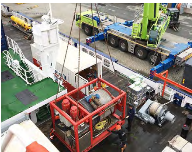
Figure 1: At Pier 24 in the port of Breivika/Tromsø, a special crane has hoisted the 18 t ROV winch onto the aft deck of RV MARIA S. MERIAN.