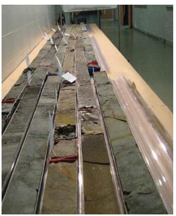
BBCP cores @MARUM

Please tell us as soon as possible (but no later than 17 June 2022) if you plan to organize a small workshop and for how many participants you anticipate to design it!