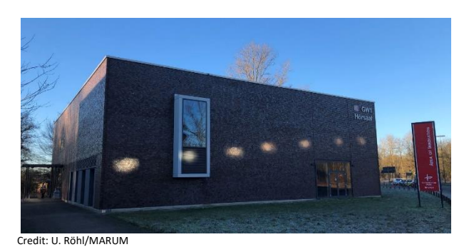
Directly connected to the airport Bremen, the venue is just 5 km north of the historic center with nearby accommodation and excellent transportation connections to all sites of

'GW1+HS' in the Campus map: <a href="www.uni-bremen.de/fileadmin/user upload/universitaet/lageplan/202">www.uni-bremen.de/fileadmin/user upload/universitaet/lageplan/202</a> <a href="total-universitaet/lageplan/202">10415</a> Lageplan Legende Uni Bremen.pdf